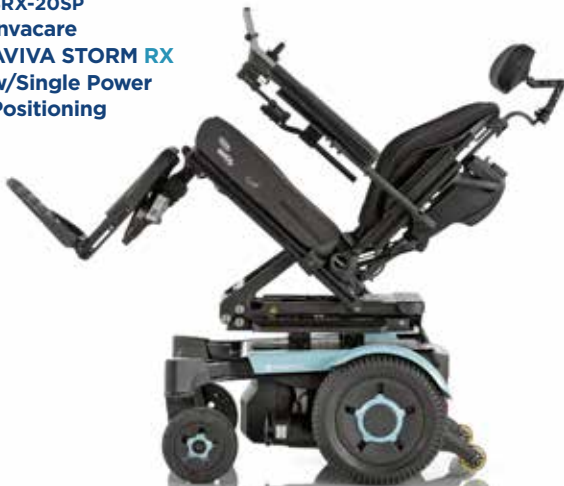
K0856* SRX-20SP Invacare AVIVA STORM RX w/Single Power Positioning