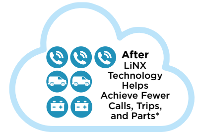
After LiNX Technology Helps Achieve Fewer Calls, Trips, and Parts*