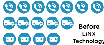
Before LiNX Technology

Thanks to LiNX Technology, a connected AVIVA Storm RX Power Wheelchair can transmit vital diagnostics through the Cloud to the MyLinX™ Provider Portal, meaning you can troubleshoot issues remotely, minimize unnecessary service calls, trips and more.