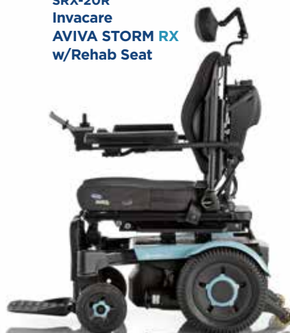
K0848* SRX-20R Invacare AVIVA STORM RX w/Rehab Seat